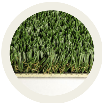
Indoor Sport Turf